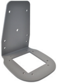
CHARGING STATION WALL MOUNT WMB1