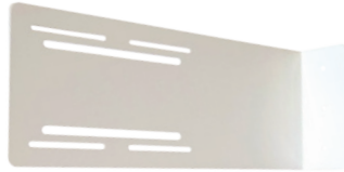
MONITOR MOUNT MB1