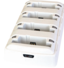
CHARGING STATION A160