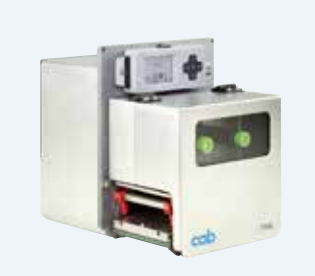
Label dispensers HS, VS