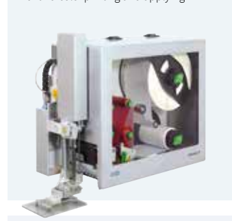
Label software cablabel S3